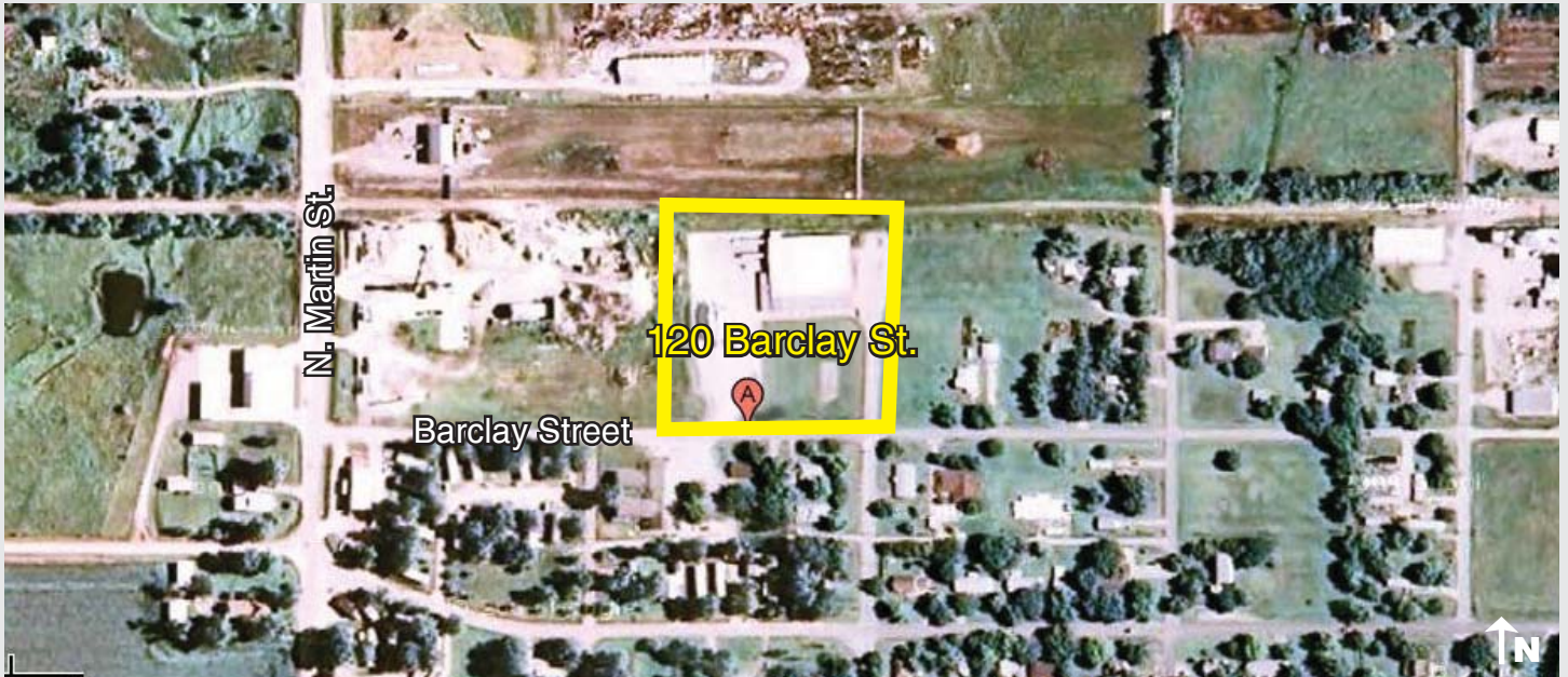
Property Aerial and Locator Map